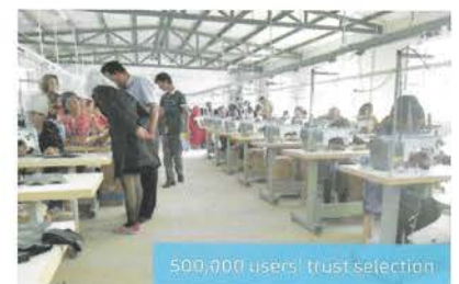
500,000 users' trust selection