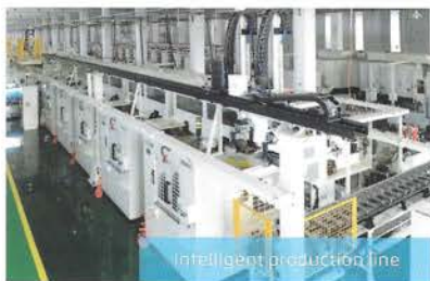
Intelligent production line