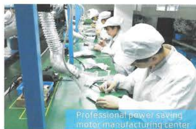
Professional power saving motor manufacturing center